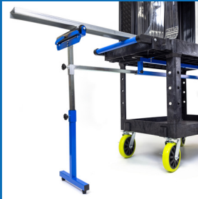
Adjustable material supports for long material