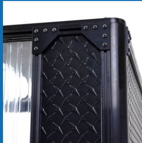
Rugged diamond plate panels, and extruded framing