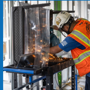
3-sides of protection from sparks and debris