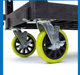
8" Max-Endurance Casters, four (4) swivel w/ brakes