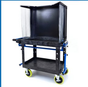
Compact, lightweight design for mobility