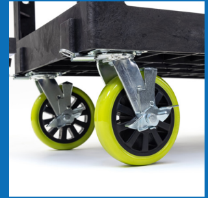
8" Max-Endurance Casters, four (4) swivel w/ brakes