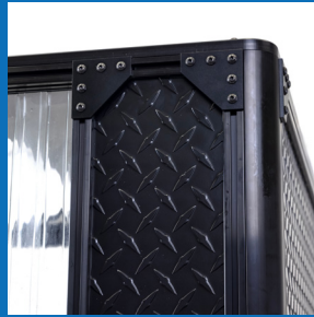
Rugged diamond plate panels, and extruded framing